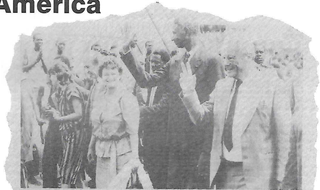
Les présidents Abdou Diouf et Willy Brandt accueillis par les militants du PS du Sénégal à leur arrivée sur les lieux du conseil.